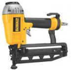
Finish Nail gun