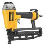
Finish Nail gun